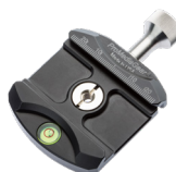
#C60 Arca Type Clamp