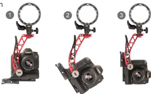
#BBGv2 Shown with Profoto B2 on #BLSA 5/8" adapter