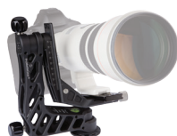
#GKJr. Katana Junior Gimbal