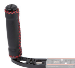
#HB70 Handle for Bracket Plates