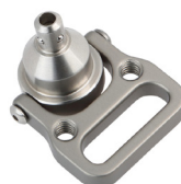
#SS2P1 Quick Release Strap System