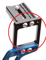
#FCMR Raiser / Extender