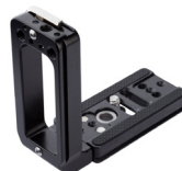
** L-Brackets ** Universal and Custom Available