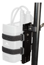
#BL01 Universal Battery Harness