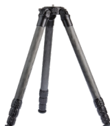
34 Series Pro-Stix Carbon Fiber Tripods